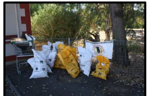
Clean Up Australia Day - March 2013