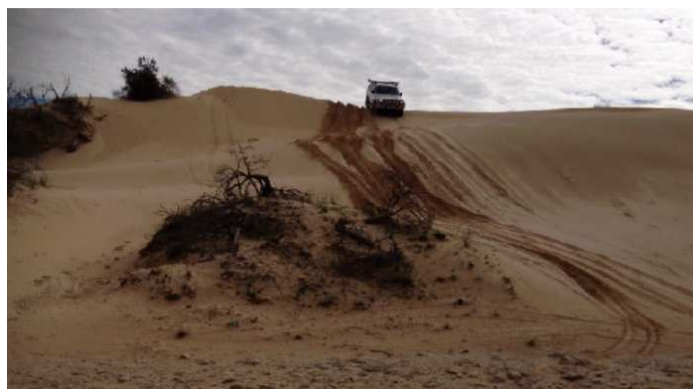
Driving like a Pro – Late Sunday Morning