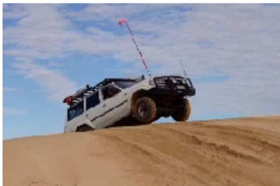
Is that some air we see?