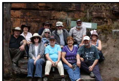
Horseshoe Top End - April 2013