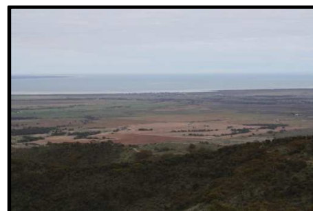
Kookaburra Creek - June 2013