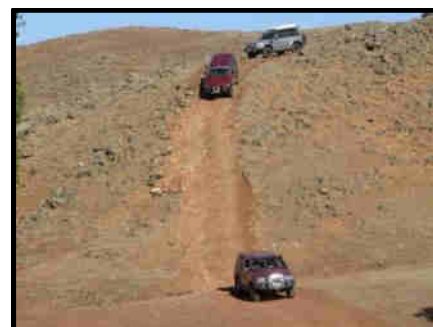
Saunders Gorge - March 2009