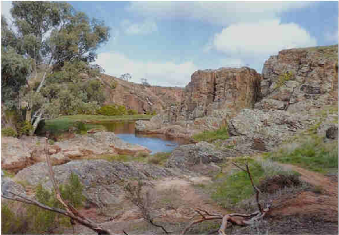
APPILA STRINGS (Flinders Ranges) by MAX LESKE

AND NO, YOU ARE NOT SEEING DOUBLE!! GAWLER FISHING AND OUTDOORS along with our own PEOPLES CHOICE independently choose these different photos by different photographer's taken from almost the exact same place – Clearly a beautiful spot and well done to both winners!