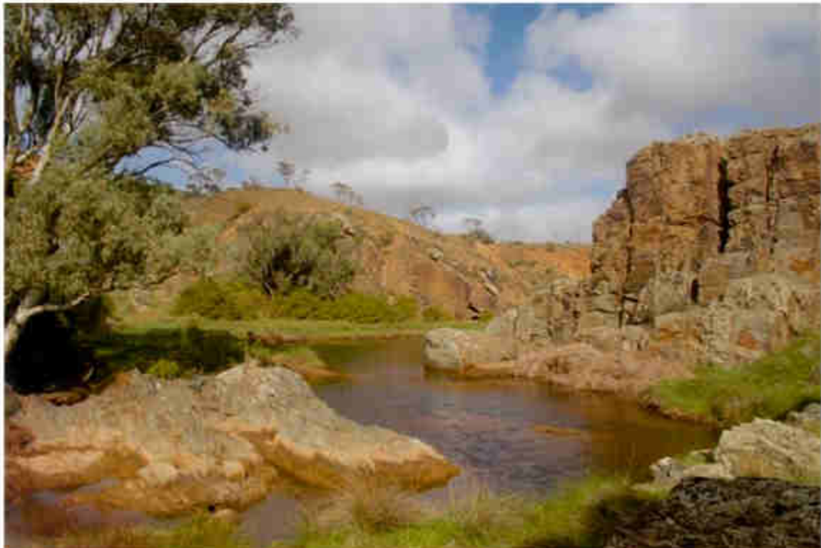
APPILA SPRINGS (Flinders Ranges) by QUENTON EARL

AND NO, YOU ARE NOT SEEING DOUBLE!! GAWLER FISHING AND OUTDOORS along with our own PEOPLES CHOICE independently choose these different photos by different photographer's taken from almost the exact same place – Clearly a beautiful spot and well done to both winners!