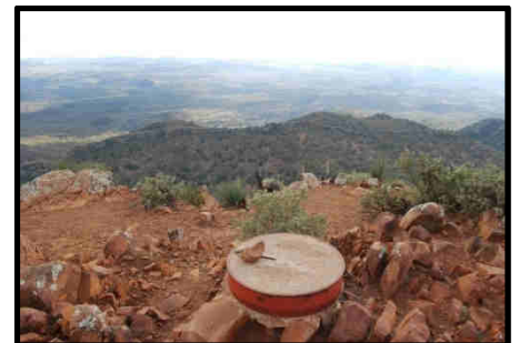
Willows Springs - June 2011