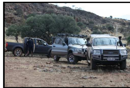
Mt. Ives - April 2015