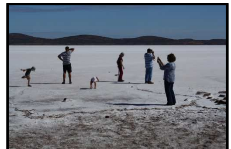
Mt. Ives - April 2015