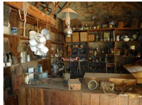
Easter 2016 - Holowiliena Station