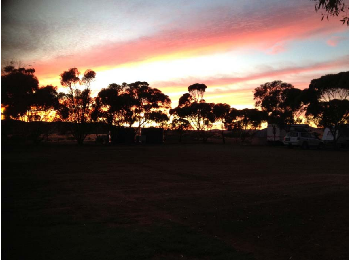
Sunrise at Carrieton