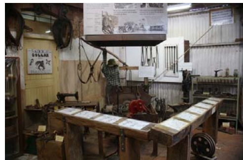
Mystery History Day