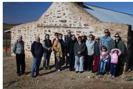
Sir Hubert Wilkins Cottage