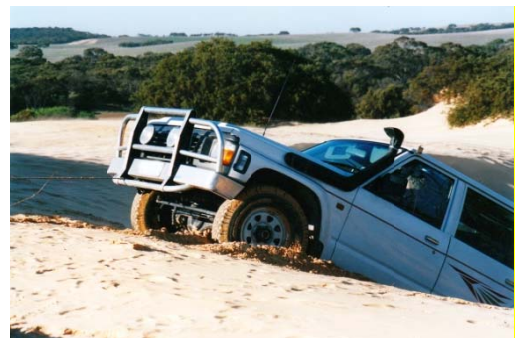
Recovery Training at Peake