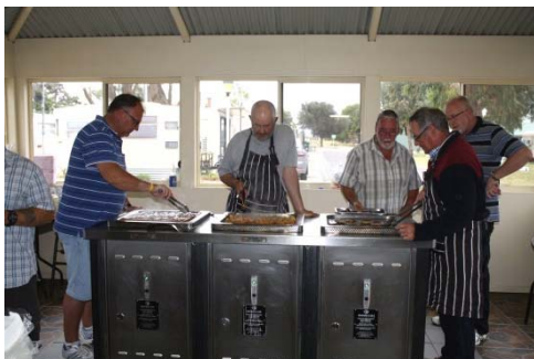
Xmas Party Cooks

Gawler and Districts 4WD Club Incorporated is an active and supporting member of Four Wheel Drive South Australia