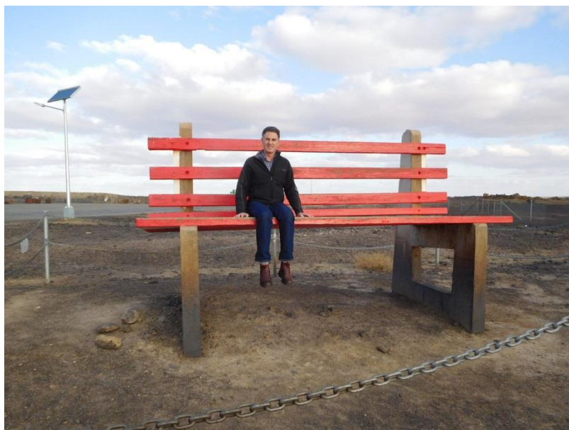
The Big Seat at Broken Hill