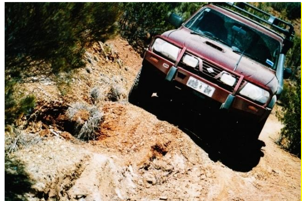
From the Archives - Bendleby 2002