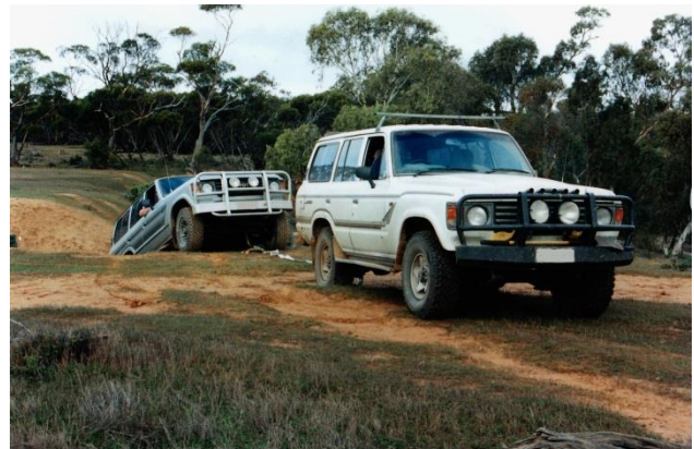
Burra Gorge 2002!!