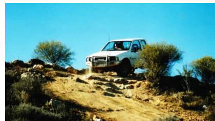
Morgan Training 2002