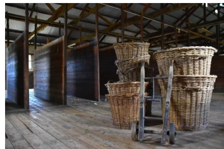
Shearing Shed at Rosebank ("Killarney")