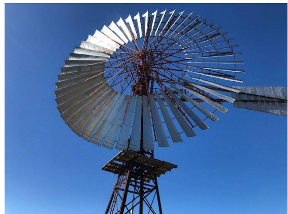
Windmill Museum, Penong - "town of 100 windmills!"