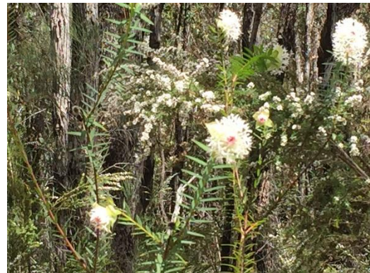
WA Wild Flowers