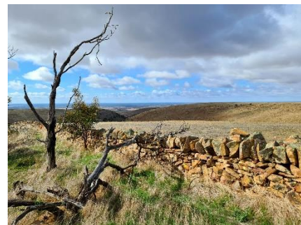
Mystery Drive – May 2023