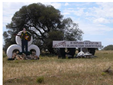
Bindmurra Station - October 2009