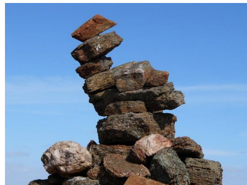
Photos from the Archive - Who can name this location? (hint, taken Mar 2009)