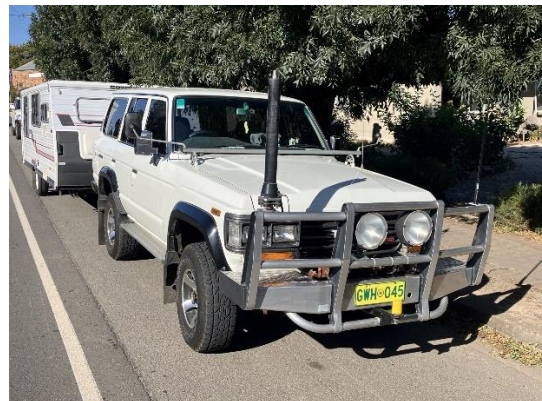
Classic Vehicles Spotted in Auburn