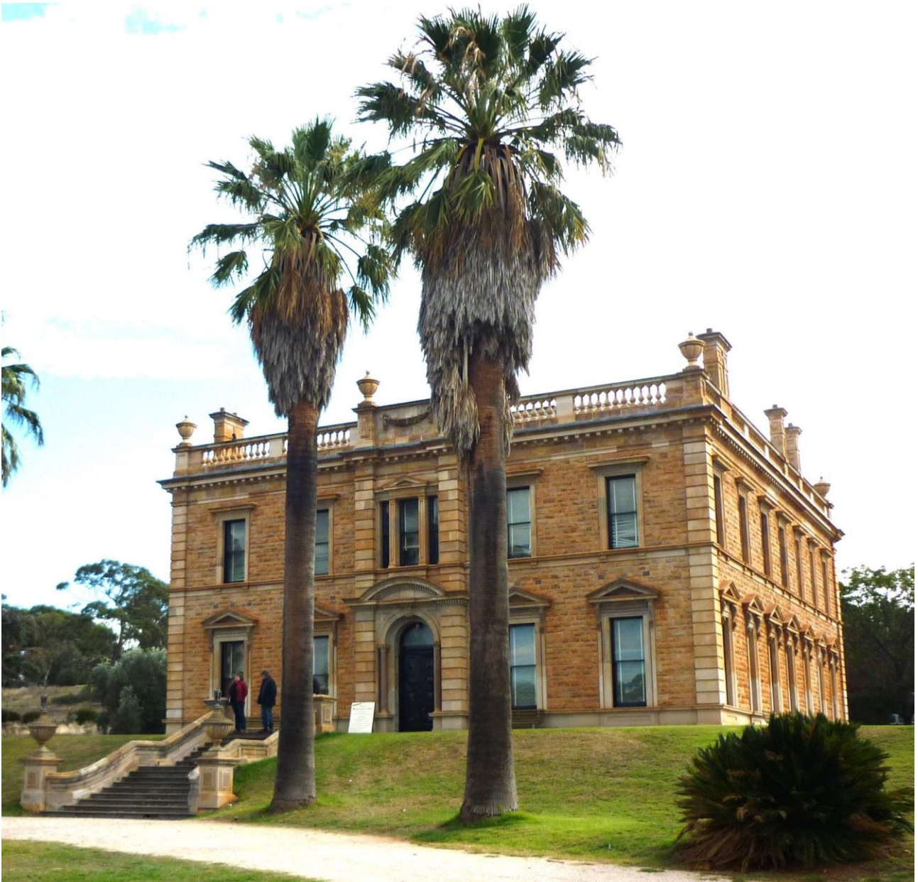
Martindale Hall, Mintaro