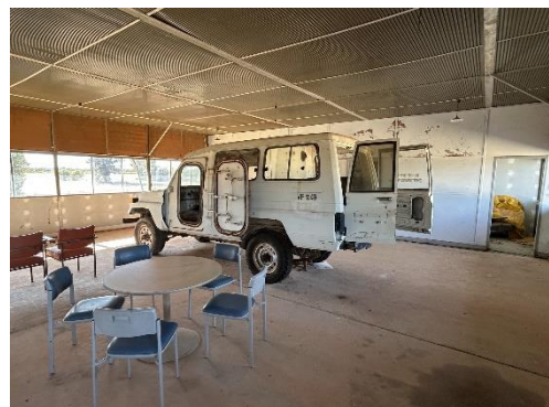
Clean-Up Monitoring Vehicle at Maralinga