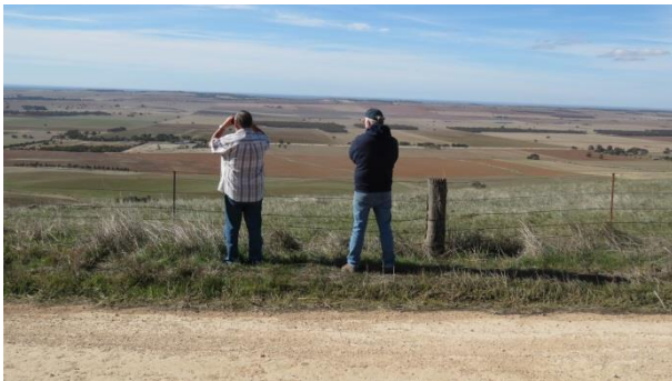
Where did the bikes go?