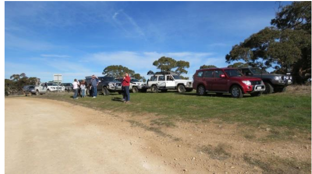
Waiting for the bikes to get going