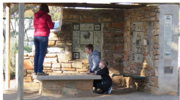
Looking for the best light