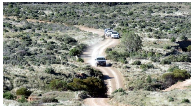
A bit dusty down the back!!