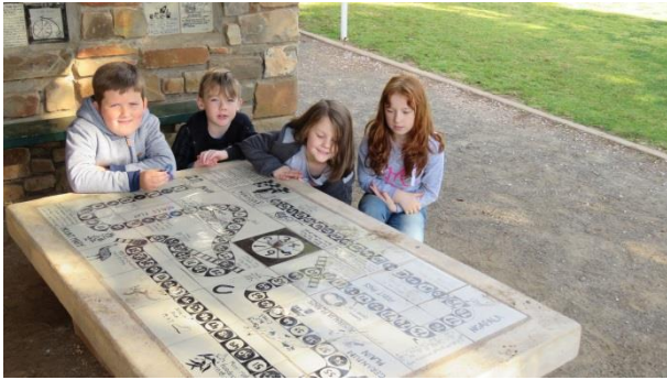
Snakes and Ladders at Colin Thiele Park

Some more photos from the Southern Burra Trip